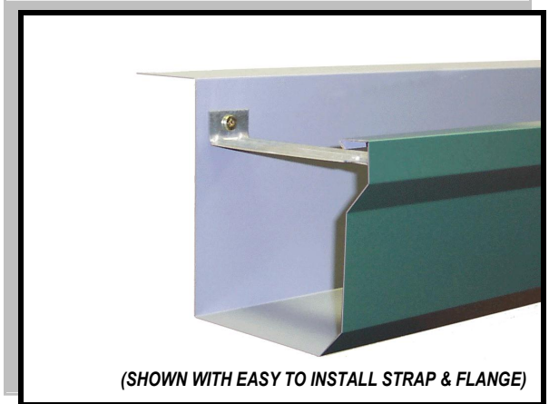
(SHOWN WITH EASY TO INSTALL STRAP & FLANGE)

REFER TO DMI COLOR CHART FOR STOCK COLORS