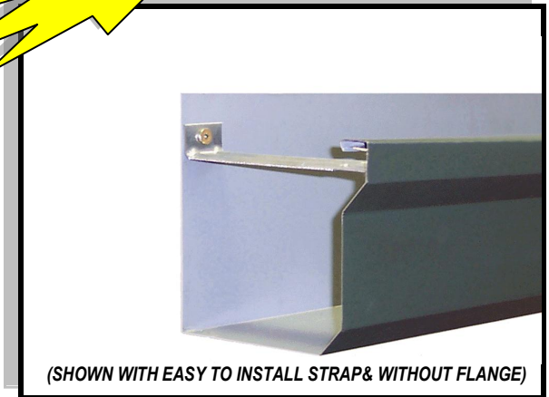
(SHOWN WITH EASY TO INSTALL STRAP & WITHOUT FLANGE)